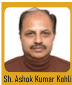
Director Ele. Education (H.P)