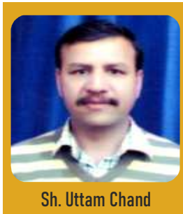
Principal Utkrisht G.G.S.S.S. Rohru

Being the head of this institution, I am trying my level best to provide value-based education with the help of worthy & dedicated teachers. And I also appeal all the parents for your valuable co-operation and hope that all of us shall contribute to inculcate values and ethics in our pupils so that they emerge as responsible citizens of our country.