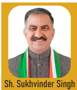
Hon'ble Chief Minister (H.P)