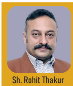
Hon'ble Edu. Minister (H.P)