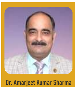
Director Higher Education (H.P)